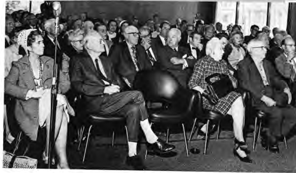
Out of camera range were many shareholders who with those shown made attendance the largest ever at a WP annual meeting.

"On the cost side, we continue to be faced with heavy inflationary pressures. Unit costs of material are increasing and all evidence indicates that nationally negotiated wage rate increases this year will equal or exceed those of 1969. In addition to the wage rate increases already in effect, we are making accrual provision for those still under negotiation, retroactive to January 1. Fringe benefit