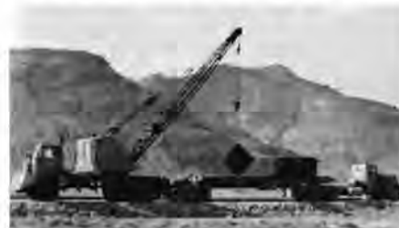
Above and right: Nearly 37,000 treated ties and more than 69,000 track feet of rail were used in construction of the new branch line.

All track construction work was done by Western Pacific forces under the supervision of Senior Process Supervisor J. L. "Red" Larson (general construction) and Engineer Inspector (Continued)