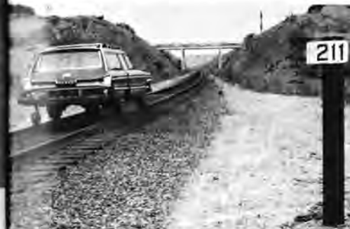
Milepost 211: Just after crossing Feather River bridge. Cherokee Road overpass ahead.