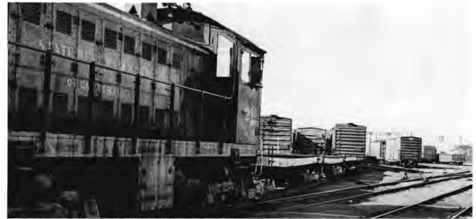
"Belt" engine switching in Embarcadero yard.

average day, "the Belt" handles 130 cars although its capacity is much greater. In the war year 1945, for example, the railroad handled 259,649 cars, including 156 troop trains and 265 hospital trains.