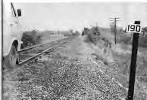
Milepost No. 190: Hy-Railer on main line midway between Tambo and Craig.