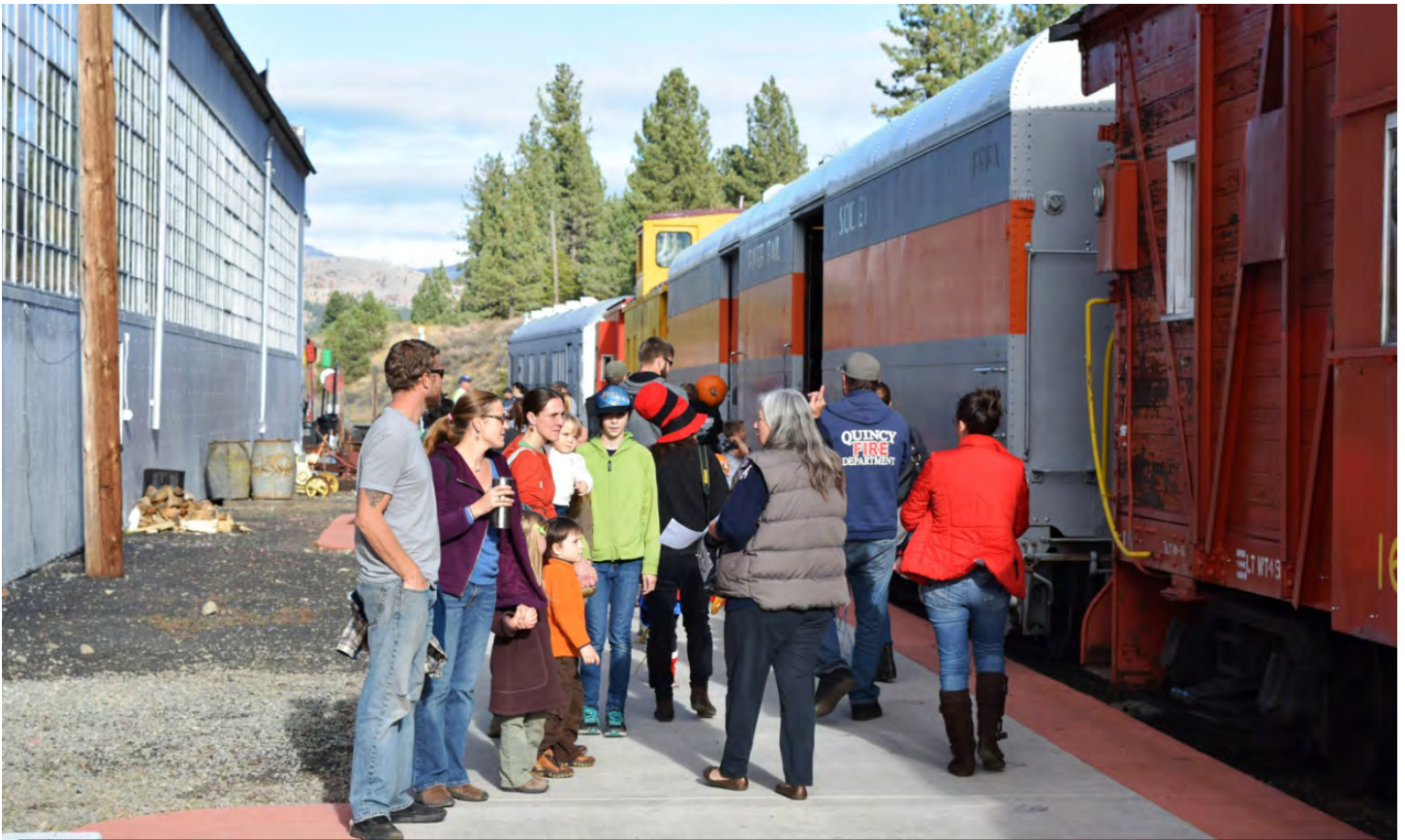
Passengers prepare for boarding an afternoon run of the Pumpkin Patch Express on 21 October 2017.