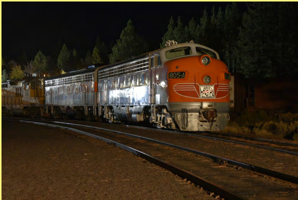
WP 805A sits on the west end of Track 4 on 21 October 2017, lit by the backup light on the Pumpkin Patch Express. Night runs were a popular addition this year.

I am always looking for feedback, content and new ideas. If you have some, please don't hesitate to contact me at webmaster@wplives.org .