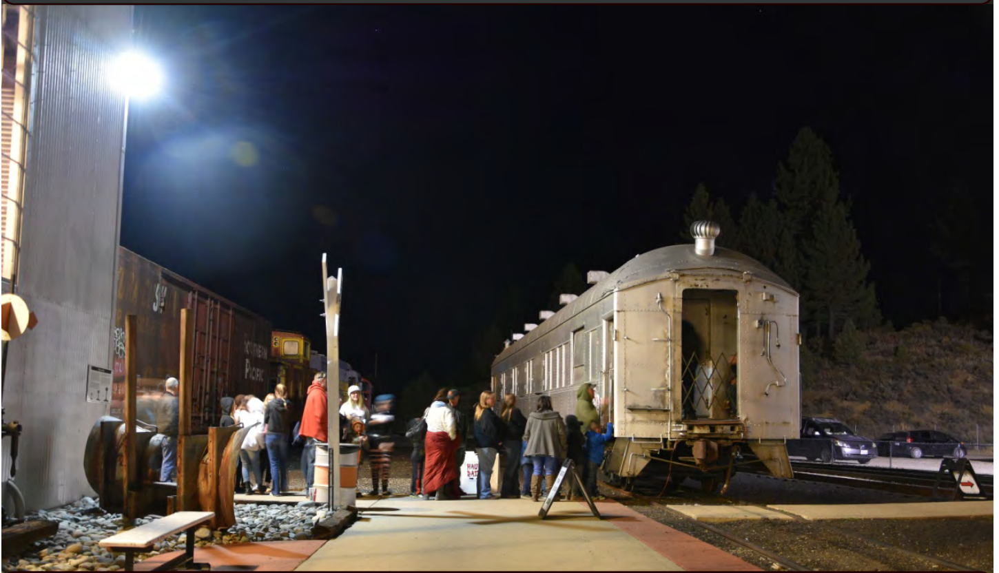
The Haunted Railcar was a very popular attraction during the Pumpkin Patch Express weekends. The line seen here goes all the way to the shop entrance.