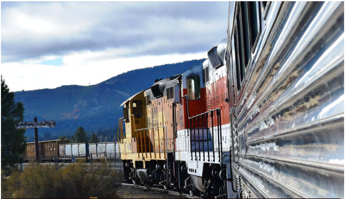
SP 2873 and WP 707 bring an afternoon run of the Pumpkin Patch Express past Malfunction Junction to the pumpkin patch, as seen past the Silver Plate, a CZ Dining Car. 21 October 2017.