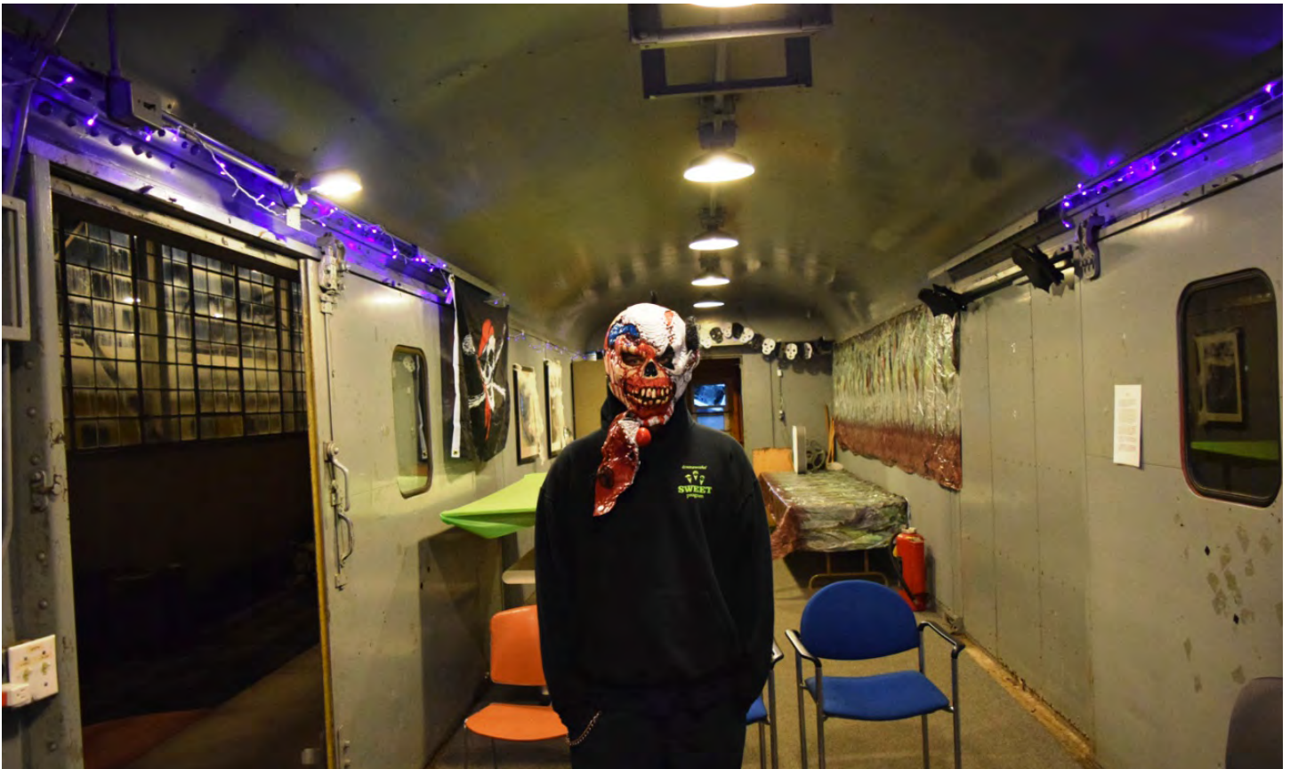
A Portola Fire Department volunteer who helped make the night runs a bit more scary.