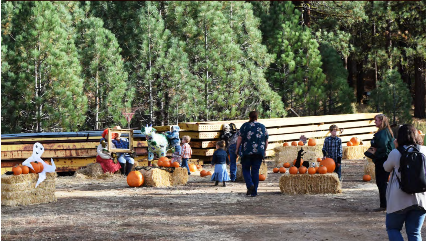
The Pumpkin Patch was popular, going through almost nine bins of pumpkins over the course of the two weekends.