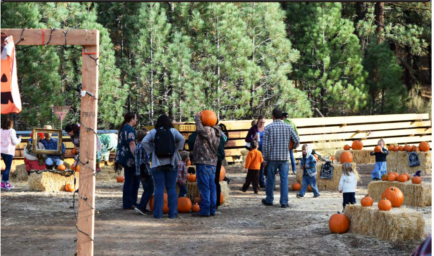
Passengers select pumpkins at the Pumpkin Patch.