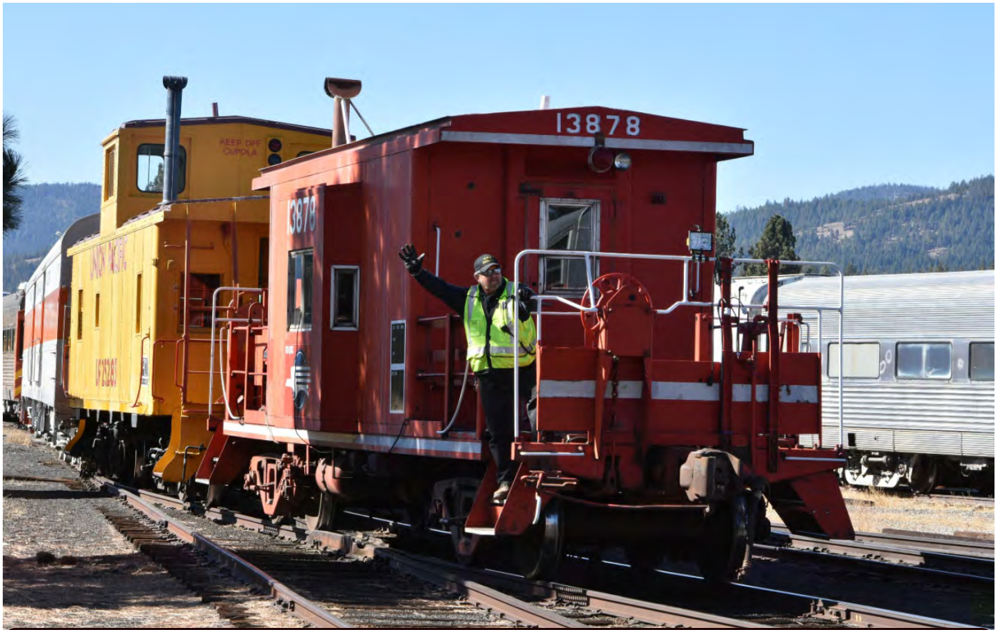
Conductor Loren Ross directs the reverse move back to the loading platform on an afternoon run of the Pumpkin Patch Express on 14 October 2017.