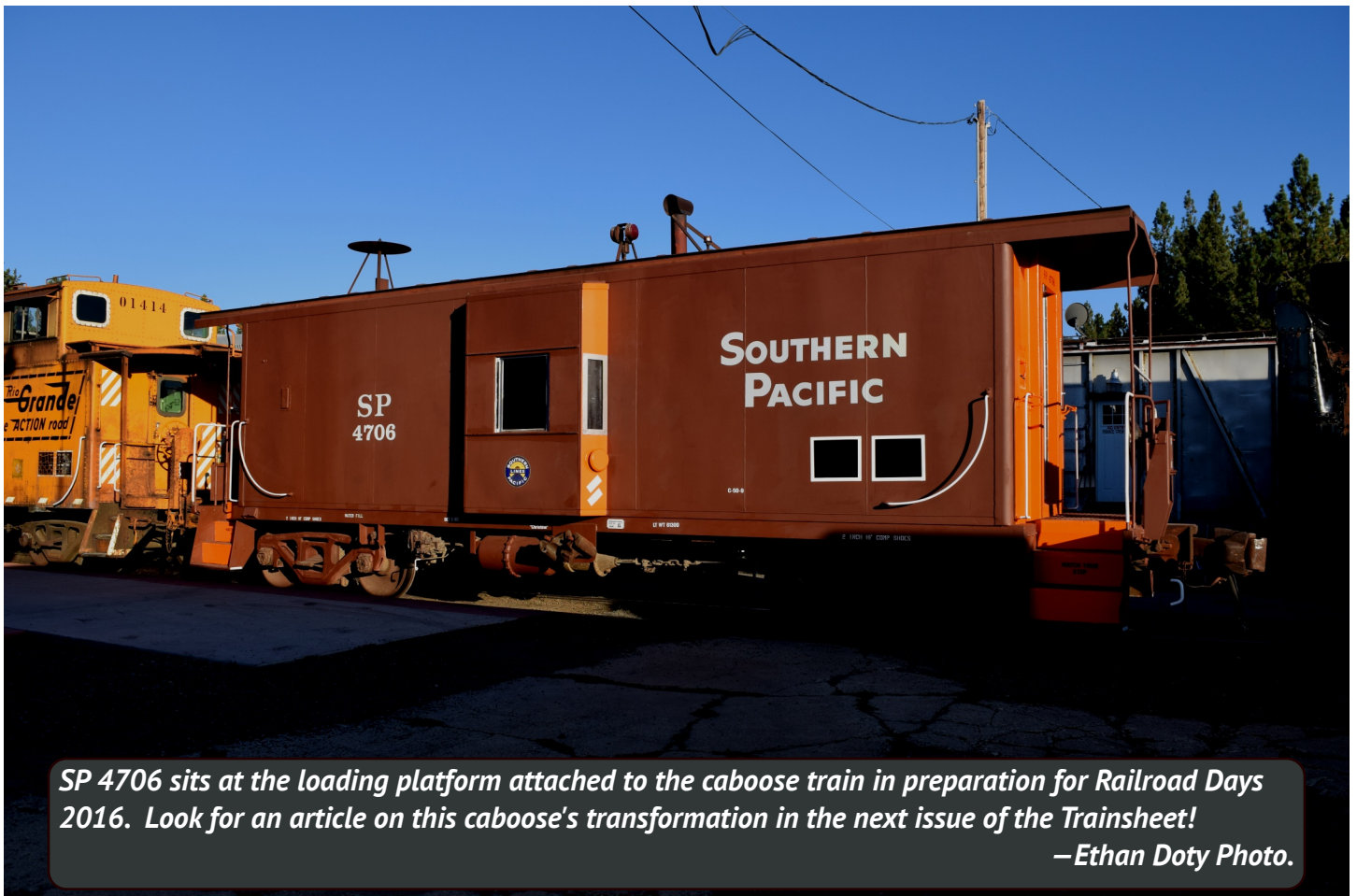
SP 4706 sits at the loading platform attached to the caboose train in preparation for Railroad Days 2016. Look for an article on this caboose's transformation in the next issue of the Trainsheet!

PRSR STD U.S. Postage PAID Permit No. 580 Manhattan, KS 66502