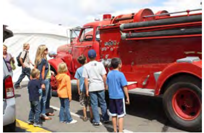
Our former Southern Pacific fire truck made its Hot August Nights debut this year. (above)