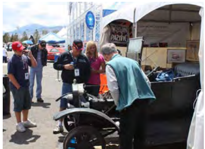
HAN visitors checking out our Model "T" railcar.