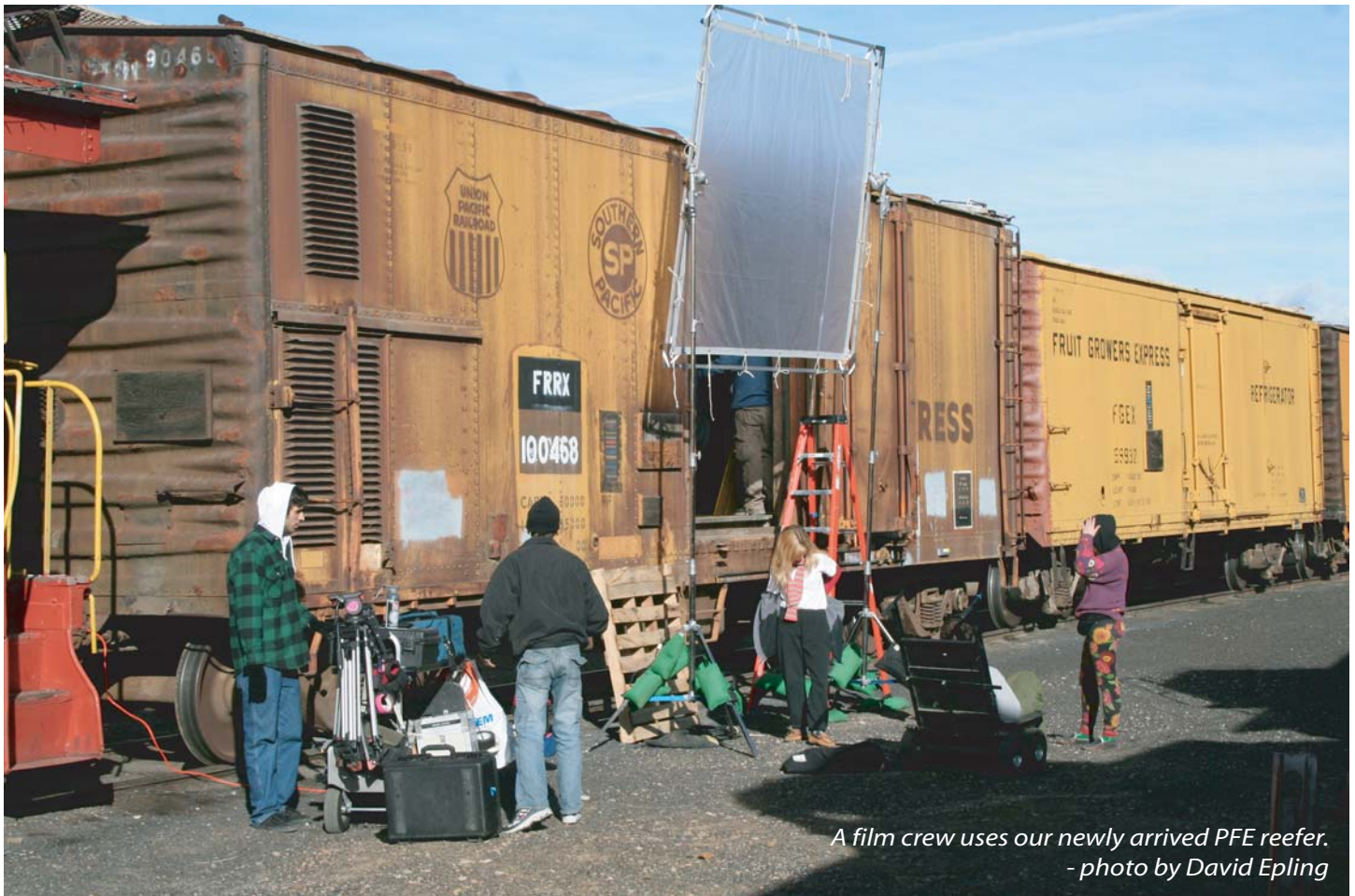
A film crew uses our newly arrived PFE reefer.