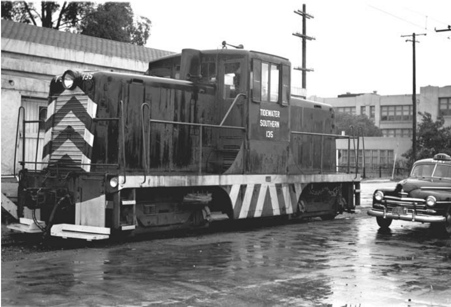
TS 135 is less than 2 years old in the rainy view above from Pittsburg, CA. The Sacramento Northern has borrowed the Tidewater's first diesel to help with trains to the booming steel mill east of town.

Estimates to move the engine are running about $12,000. We have raised $5,500 through donations to save the 735, and are working on a deal to get a much cheaper rate, but we still need more funds to move and stabilize this engine. Please donate to the TS 735 Fund to help bring this engine back to California: FRRS - TS 735 Fund .. P O Box 608 .. Portola, CA 96122.