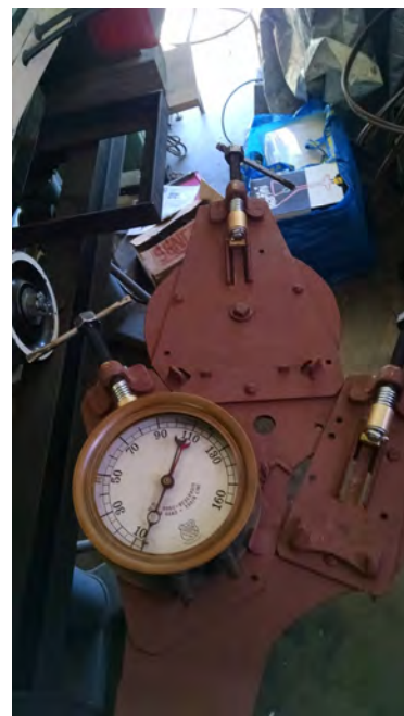
The gauge stand in progress.

Our next work session is May 6th-9th 2015 . I hope to see some significant progress this season, so come on up to Portola and see for yourself! And as always, please consider a tax-deductible donation, in any amount, to the WP 165 Steam Fund. Let's keep the momentum going!