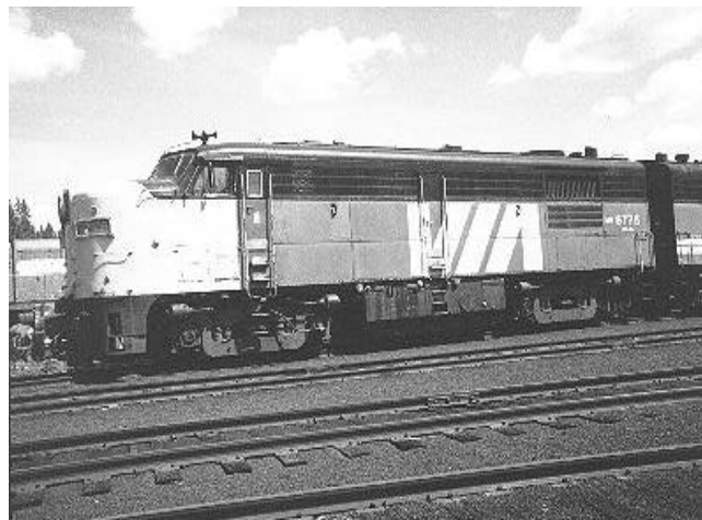
Prior to shipment to Arizona FPA-4 6776 basks in the warm Portola sunshine.

The Grand Canyon Railway has purchased our VIA units FPA-4 6776 and B-unit 6860. This brings the GCRY total to five cabs and two boosters. This additional power is primarily for a second train the Grand Canyon plans to be running by the spring. After an inspection in Portola CMO Franzen stated the pair are in very good shape, but that they do need some work and paint. A work crew from GCRY were in Portola during the first week of June to prepare the units for the trip to Arizona and their new home on the GCRY. This preparation included removing any easily pilferable items, making protective covers for all cab windows and welding the doors and electrical cabinets shut. The units were transferred to the UP on June 17th and arrived at the Grand Canyon on July 7th. Work is now underway on the units with an expected in-service date of March 2000.