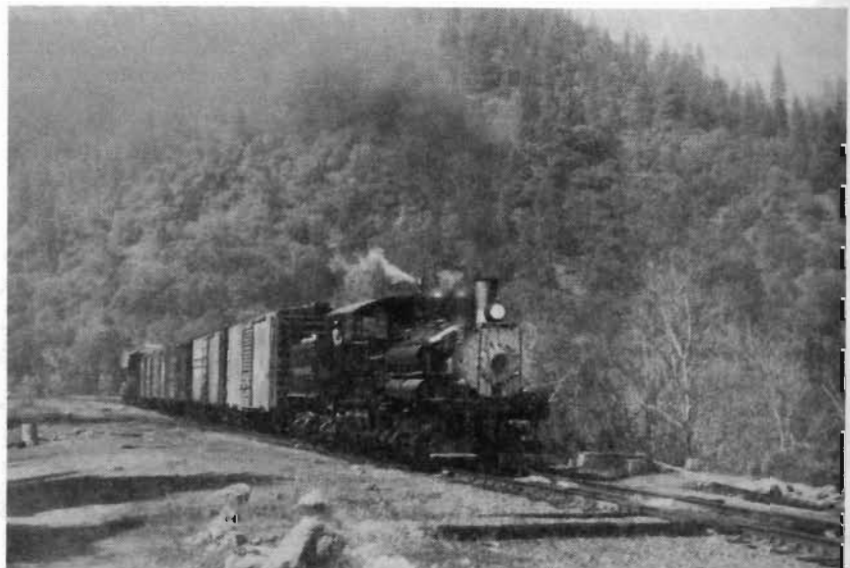
Feather River Ry. Shay No. 2 makes its final revenue run on March 29, 1966 at Berry Creek on the old WP mainline. Kent Stephens

We have F units but no work! Do any of our members have contacts with film locating companies? We have equipment; box cars with roof walks, refrigerator cars with ice hatches, various types of diesel locomotives, some passenger cars and a steam engine. Any work we can get using our equipment would be a good source of revenue for us.