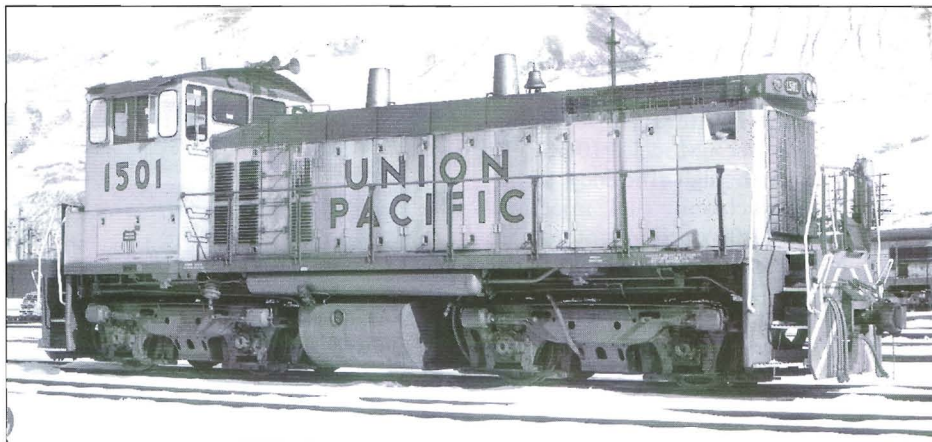
Ryan Ballard/Diesel Era collection