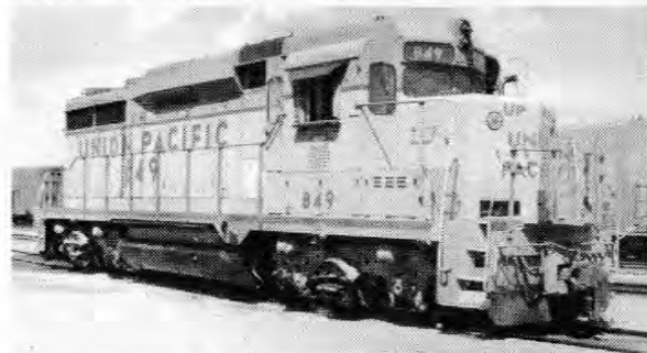
GP30 Union Pacific 849 is one diesel at Portola.

All members receive the official publication of the Society, "The Train Sheet," bi-monthly. It contains museum news, activities, photographs, upcoming events and projects.