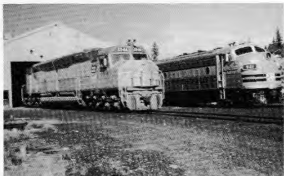
DDA40X UP 6946, F7A WP 921D along with the last Zephyr unit WP805A are at the museum site.

With over 36 diesels, the Society has one of the largest collections of preserved diesels and over 85 pieces of freight, passenger and maintenance of way equipment. All equipment will be restored as time and funds permit.