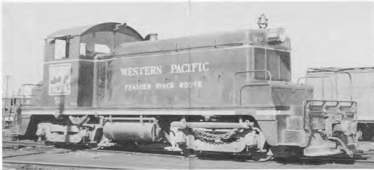
Preserved in Portola is the WP 501, an EMD SW-1 built in 1939 which was the first diesel on the Western Pacific.

The Feather River Rail Society , a tax exempt California Corporation, operates the PORTOLA RAILROAD MUSEUM at Portola, California. Formed in February, 1983, to establish a railroad museum in Portola with the purpose of preserving local railroad history in general and Western Pacific Railroad history in particular. As a Society, we are involved with restoration and collection of railroad equipment, photos, artifacts, historical information and data.